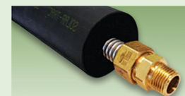
Insulated Flexible Pipe